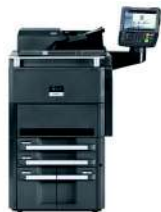
Shown with standard 270 sheet DSDP