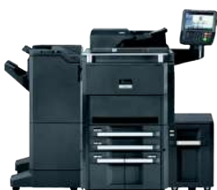
Shown with standard 270 sheet DSDP, optional 3,000 sheet side LCT and 4,000 sheet finisher