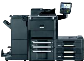
Shown with standard 270 sheet DSDP, optional 500 x 2 sheet paper trays, 500 sheet multi-purpose tray, and 4,000 sheet finisher