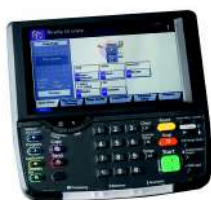
Newly designed, easy-to-use large color touch screen control panel